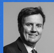
GREG HANDS MP Minister without Portfolio and Conservative Party Chairman