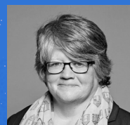
THERÈSE COFFEY MP Secretary of State for Environment, Food and Rural Affairs