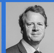
ALISTER JACK MP Secretary of State for Scotland