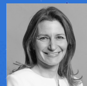
LUCY FRAZER MP Secretary of State for Culture, Media and Sport