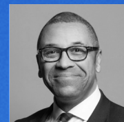
JAMES CLEVERLY MP Secretary of State for Foreign, Commonwealth and Development Affairs