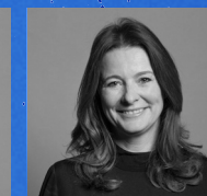
GILLIAN KEEGAN MP Secretary of State for Education