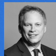
GRANT SHAPPS MP Secretary of State for Energy Security and Net Zero