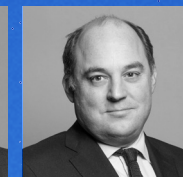
BEN WALLACE MP Secretary of State for Defence