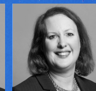
VICTORIA PRENTIS MP Attorney General