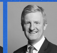
OLIVER DOWDEN MP Chancellor of the Duchy of Lancaster