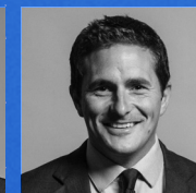
JOHNNY MERCER MP Minister for Veterans' Affairs