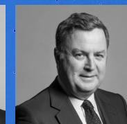
MEL STRIDE MP Secretary of State for Work and Pensions