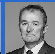
SIMON HART MP Chief Whip