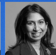
SUELLA BRAVERMAN KC MP Home Secretary