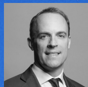
DOMINIC RAAB MP Deputy Prime Minister, Lord Chancellor, and Justice Secretary