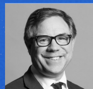
JEREMY QUIN MP Paymaster General and Minister for the Cabinet Office