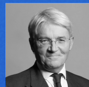
ANDREW MITCHELL MP Minister for Development