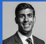
RISHI SUNAK MP Prime Minister

e info@wacoms.com.uk t +020 7222 9500 @WA_Comms wacoms.com.uk