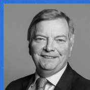
LORD TRUE CBE Lord Privy Seal and Leader of the House of Lords