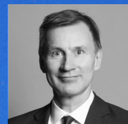
JEREMY HUNT MP Chancellor of the Exchequer